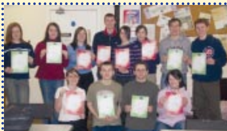
Hornsea Millennium Volunteers receiving their awards.

Contact the MV Team at Hull CVS Tel: 01482 324474